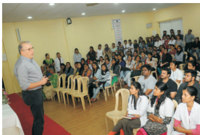
International Keynote Speaker for Seminar