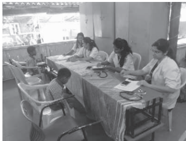
School health checkup camp