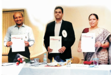
DSHMC words inhouse publication