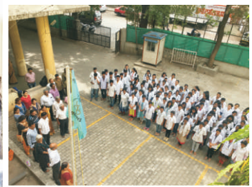
Foundation Day Celebration