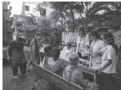
Community Outreach Program