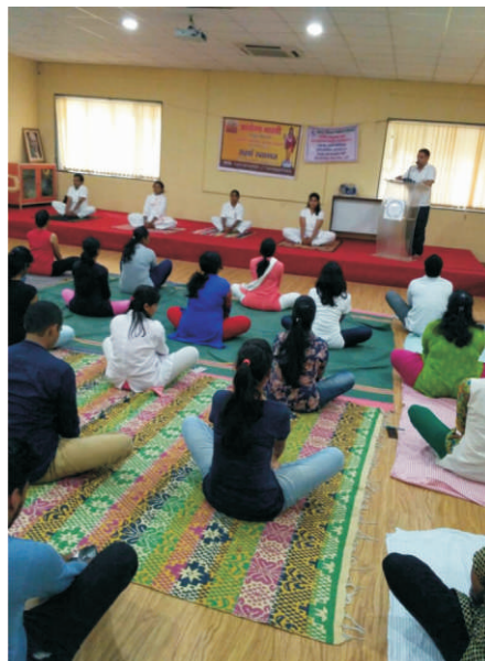
Yoga Day Celebration