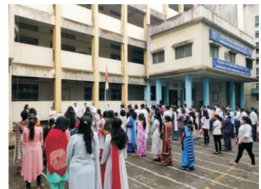
Flag Hoisting at the hands of Chairman MTES