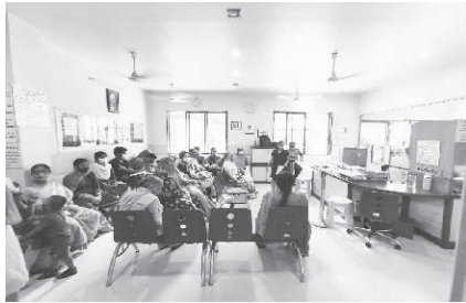
NMRMHH OPD Complex

With the team of efficient doctors and paramedical staff we have successfully treated various, acute, chronic and incurable conditions in our homoeopathic IPD, like Viral fevers Non-healing ulcers, deep vein thrombosis, acute pancreatitis, Obstructive jaundice, Psoriasis, Stroke and palliative care of malignancies and many more. These cases are published in our College's Quarterly news letter DSHMC Words.