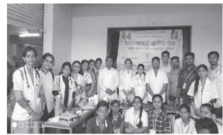
Medico Social Activity