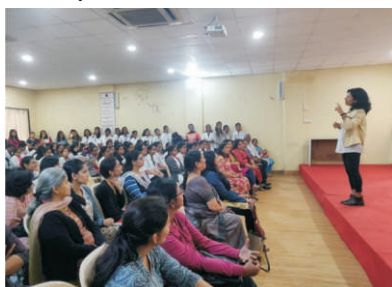
Our Alumna ... Guest Speaker