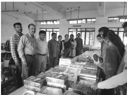
Books Exhibition in Library