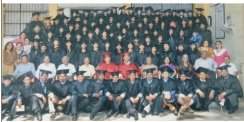
Graduation Day Celebration